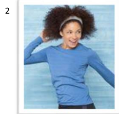
2 Long Sleeve Shirt Logo Screen Print Left Breast $15.00