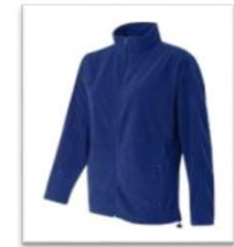
4 Zip Up Fleece Jacket Logo Imprint Left Breast $27.00