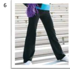
6 Yoga Pant Logo Imprint Choice A or B $24.00