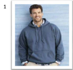
1 Hooded Sweatshirt Logo Screen Print Left Breast $20.00